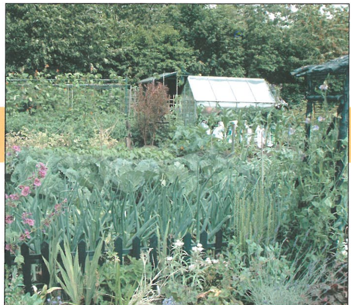
● Trafford's award winning allotments