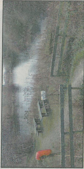
Ecology Park at Old Trafford