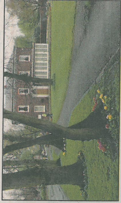
A colourful scene at Flixton Gardens