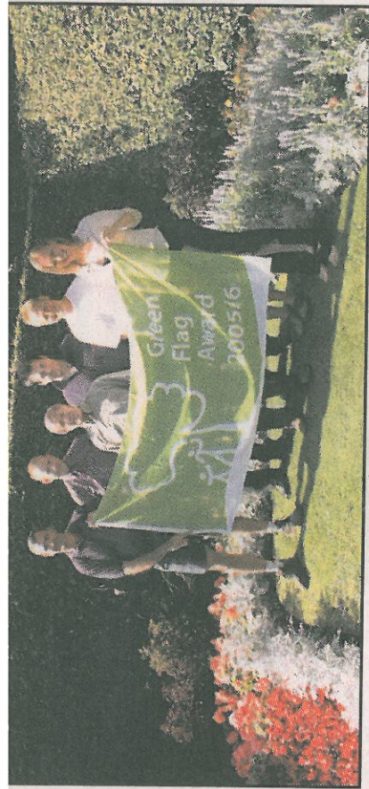
Friends of Walkden Gardens representatives celebrate 'Green Flag' success with Council staff.